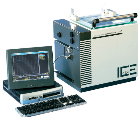
① IceCube 14S with PC and touch display monitor