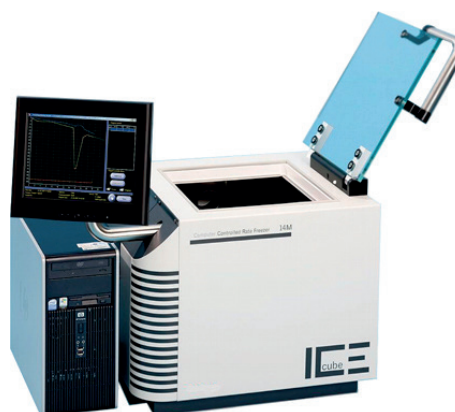
② IceCube 14M with PC and touch display monitor