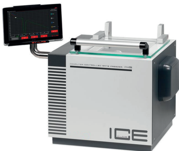
IceCube 14S with tablet-PC