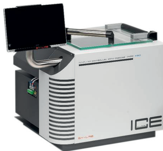
IceCube 14M with tablet-PC